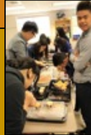
Paper Art Club Bake Sale Prep